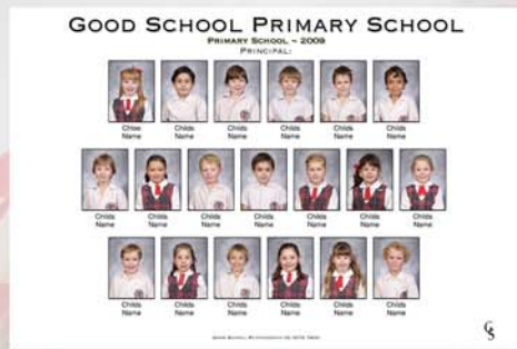
8x12 Composite Group with names

School chooses the format for Groups, Traditional or Composite