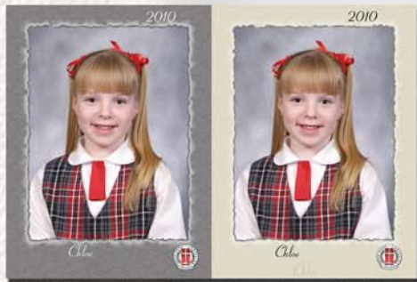
8x12 sheet consisting of 2 - 6"x8" framed personalised prints Prints also have the School logo