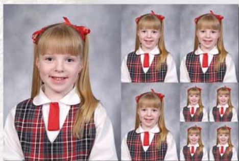
8x12 Sheet consisting of 1 - 6"x8" print, 3 - 3"x4" prints 4-passport sized prints