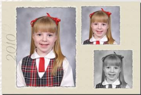
8x12 sheet consisting of 1 - 6"x8" print, 2 - 3"x3" prints (1 B&W)